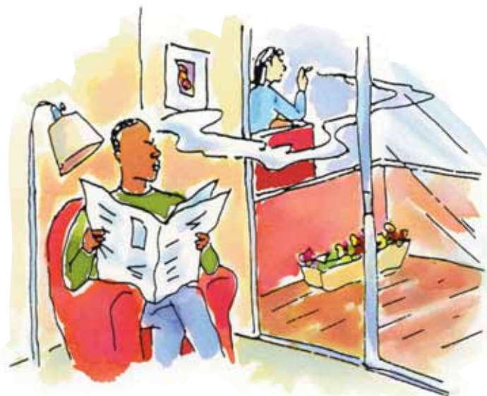
Illustrations by Janet Cleland

As a general rule, it is unwise to file a lawsuit unless you have suffered significant harm. Your chance of convincing a court that you have a justifiable legal claim is far better if you can show that you have been harmed badly by repeated, unwanted exposure to secondhand smoke in your apartment—for instance, if you have visited a doctor with frequent respiratory complaints, missed work due to illness caused by the smoke, stayed away from